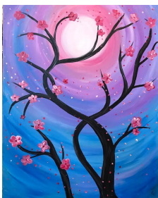
Time to Bloom— Painting