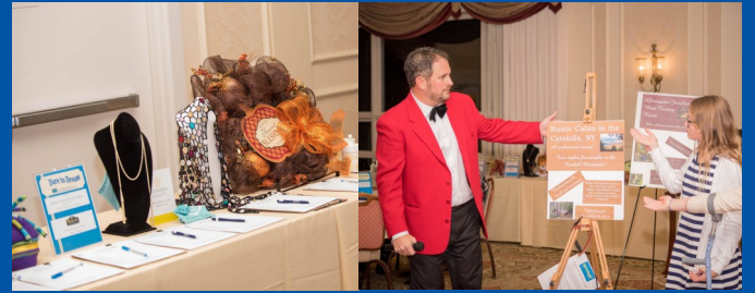
Live and Silent Auction