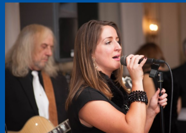
Music by Fresh