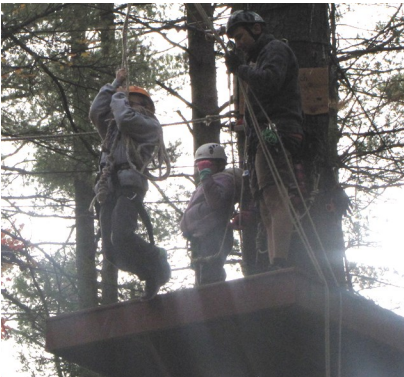
Ropes Course & Halloween Party!