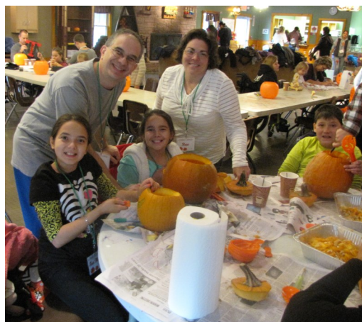
Fishing, Pumpkin Carving & Archery