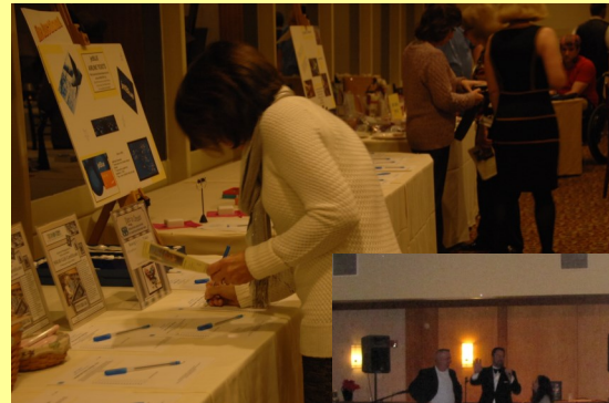
Silent & Live Auction