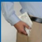
Cure Medical® Pocket Catheter