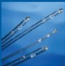
Cure Catheter® regular & new hydrophilic