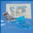
Cure Catheter® Closed System

The Cure Medical Commitment to the sustained financial support of research for a cure for SCI and CNS/D is unsurpassed in the industry. As a result, simply by using the Cure Twist™, Cure Medical® Pocket Catheter, Cure Catheter®, or the Cure Catheter® Closed System you can experience all these premium quality benefits at an exceptional value: