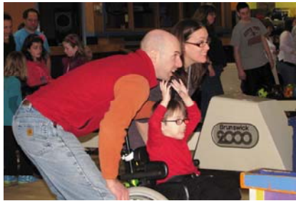
We didn't count how many strikes we got, but families had a great time!