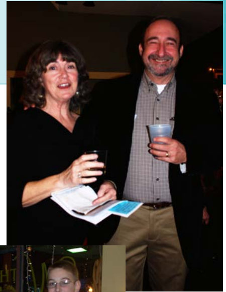
.... new friends.....