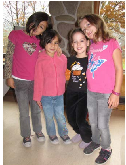
Sibling time..... The best!