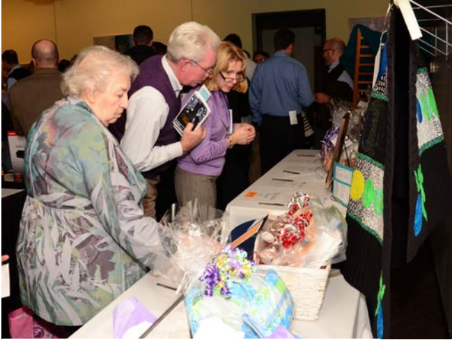
... bidding on a great silent auction.....